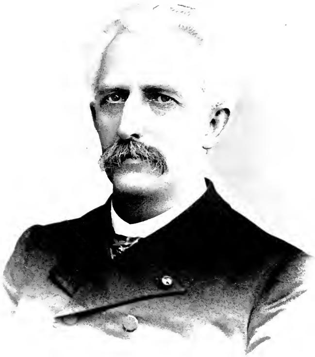
HON. CHARLES BENT, OF ILLINOIS.